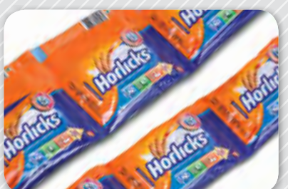
wder. 3. Pieces.