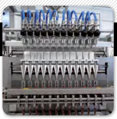
3. Forming tube assembly.