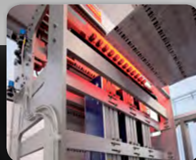
1. Laser coding and OCV cameras.