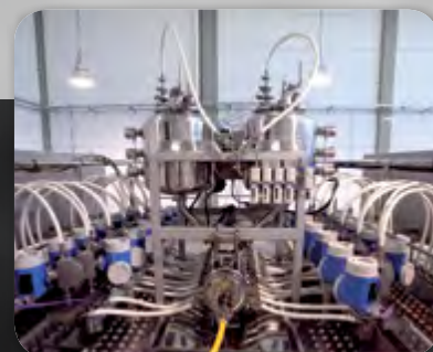
2. Mass flowmeter.