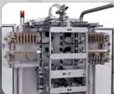
2. Side opening.