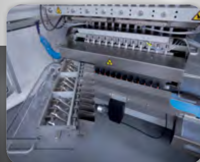
3. Independent rejection system.