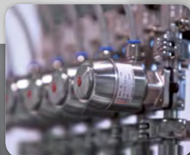
1. Shut-off nozzles.