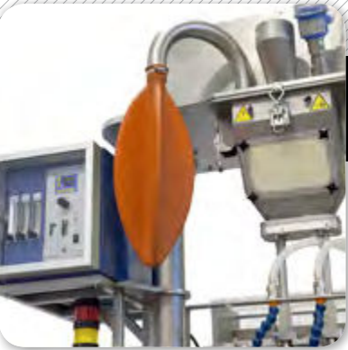
1. Gas Flushing.

Machine designed for low productions and market testing purposes . From 1 to 4 lanes.