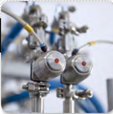
3. Shut-off valves.

Downtimes reduction due to user friendly and simple design , low maintenance and easy access.