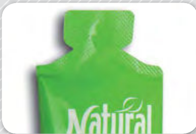
5. Shaped stick.